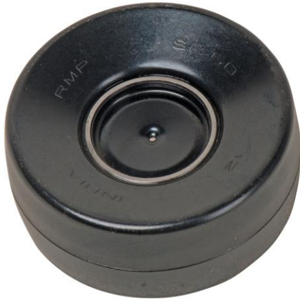
LMW Ring Frame Spindle Driving Pulley RIETER - All Ring Frame