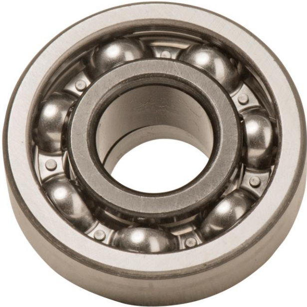
Drum Shaft Bearing for Windsor, Textools