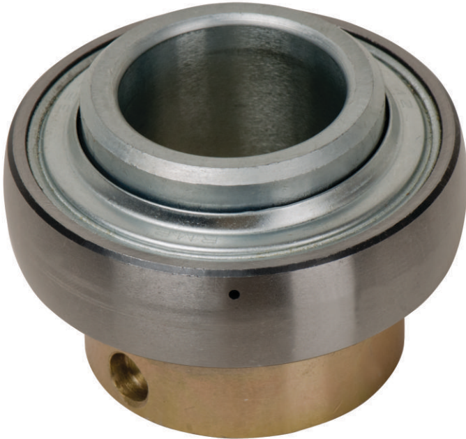
TRUTZCHLER Blow Room Assembly