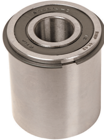
ZINSER Assembly of Roving Frame Machine