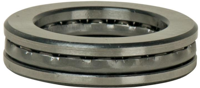
LMW Carding Machine