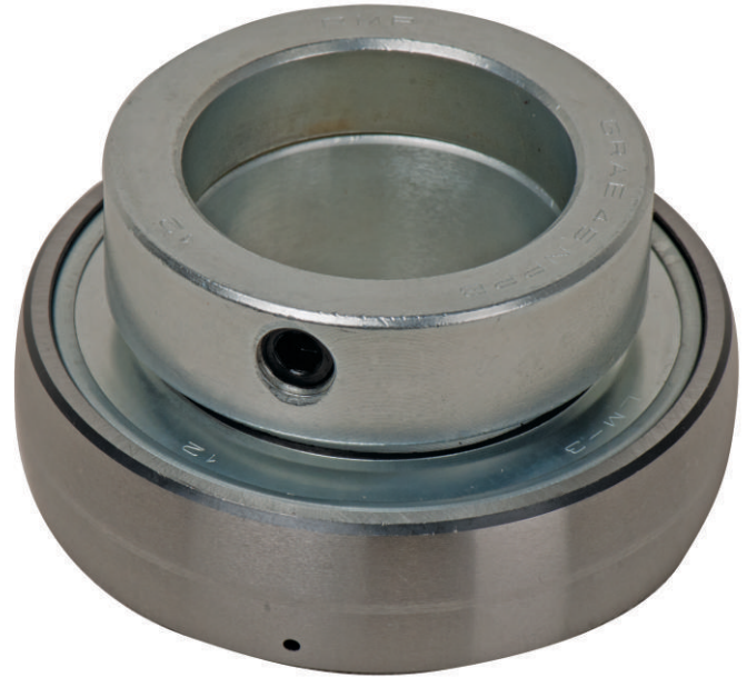
Tin Roller Bearing for Ring Frame L,M.W. / All Ring Frames