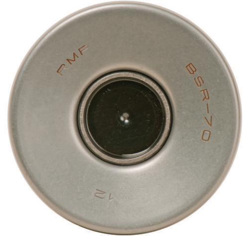
KTTM Ring Frame Spindle Driving Pulley MORZOLI